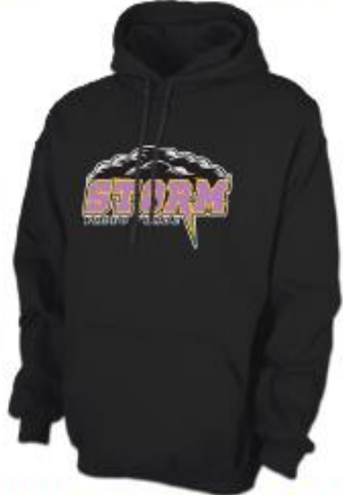
YOUTH/ADULT HOODIE $30