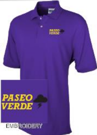
YOUTH/ADULT JERSEY POLO $23