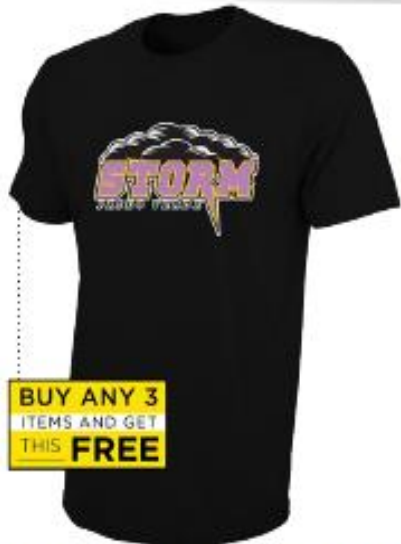
YOUTH/ADULT 50/50 TEE $15