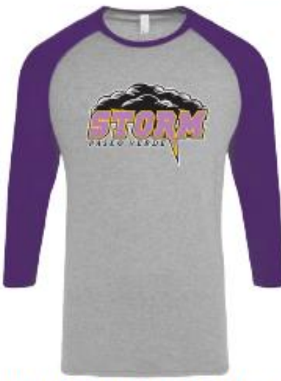
YOUTH/ADULT BASEBALL TEE $24