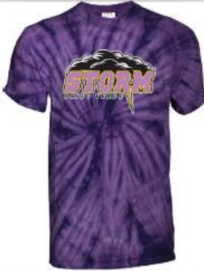
YOUTH/ADULT SPIDER TIE DYE $20