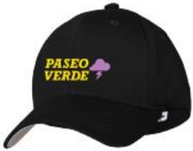
YOUTH/ADULT FLEXFIT® CAP $18

10% Of Every Purchase Directly Supports PASEO VERDE ELEMENTARY